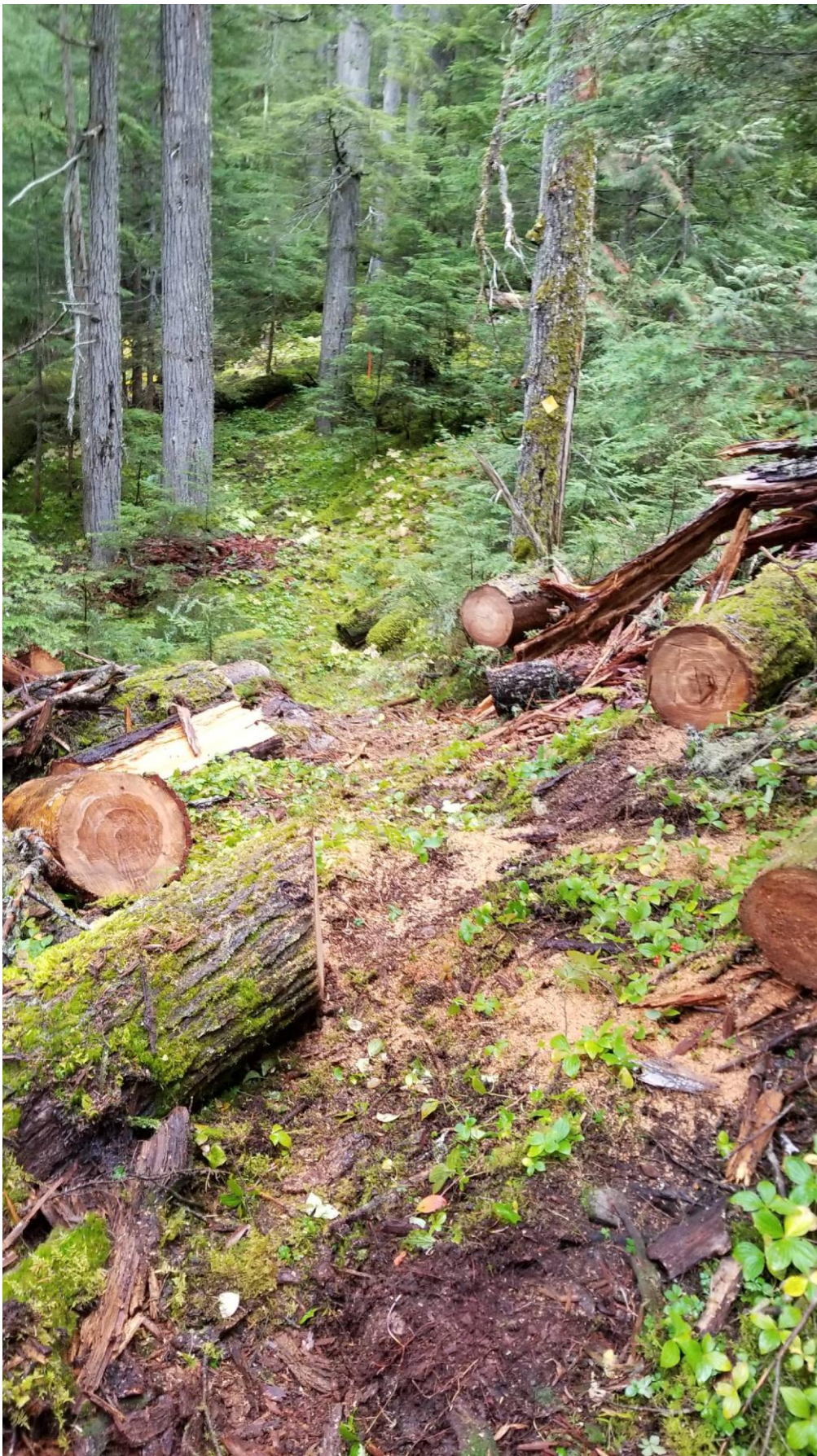
Restoration Work – September, 2021