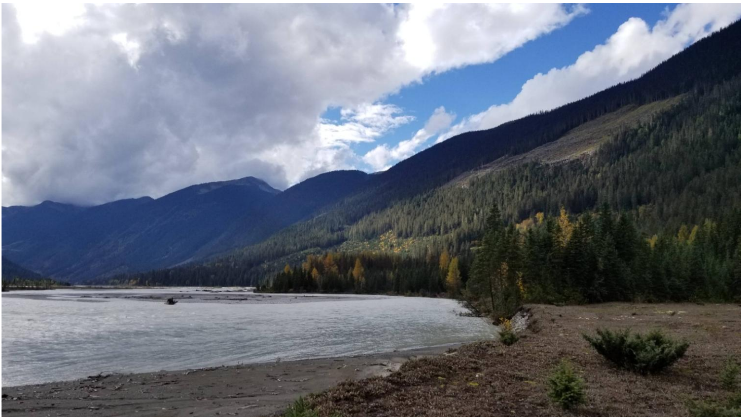
Panorama from Jeffery Creek Campground